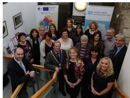
Partner and stakeholder organisations launching the first Positive Ageing Week in Newry and Mourne in 2012.

A notable highlight is the Newry and Mourne area staging its second Positive Ageing Week which is running from the 7th to the 13th of October 2013. The focus of the week is to celebrate and promote the positive aspects of growing old and to help older people make connections in their local communities. Positive Ageing Week will be launched on Friday 27 September in Newry by the Commissioner for Older People for Northern Ireland, Claire Keatinge.