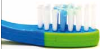
Smear for under 3 years of age