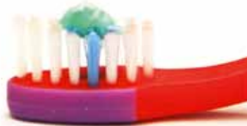
Pea-sized blob for over 3 years of age